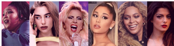
A DIVERSE GROUP OF FEMALE SINGERS INSPIRE YOUNG WOMEN.

Stefani Joanne Angelina Germanotta, professionally known as Lady Gaga, is an American songwriter, singer, actress whose work originated at open mic nights at bars and clubs. She constantly speaks out on important issues regarding women and a prime example of this