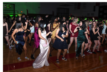
STUDENTS JOIN TOGETHER IN A LINE DANCE AS THE DJ PLAYS A POPULAR SONG.

After a tough past few years due to the pandemic, the STA Trojans have finally come out on top, setting the school on a great path for the rest of the school year with tons of spirit and hope for future seasons.