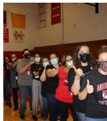
LEFT: A GROUP OF FRESHMAN AND THEIR UPPERCLASSMAN HELPERS PARTICIPATE IN VARIOUS GAMES IN THE CLASSROOMS AND A SCAVENGER HUNT THROUGHOUT THE BUILDING.