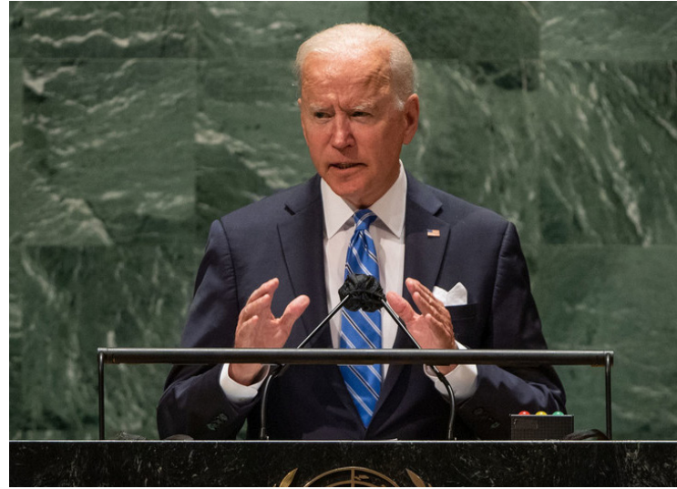
PRESIDENT BIDEN ADDRESSES THE UNITED NATIONS GENERAL ASSEMBLY, DISCUSSING A VARIETY OF ISSUES.

President Biden additionally made it known that he will start rebuilding relationships in the Indo-Pacific, with the relations in that part of the world being the most consequential. He followed up by stating that he had reaffirmed the U.S.'s commitment to NATO's Article 5 and that he had renewed his engagement with the European Union. His administration has elevated the Quad partner-