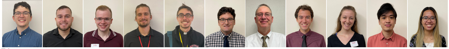
NEW FACULTY AND STAFF PICTURED FROM LEFT TO RIGHT IN THE ORDER AS LISTED ABOVE: A,B,C,D,E,F,G,H,I,J,K