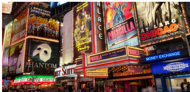
THEATER GOERS REJOICE AS THE LIGHTS ON THE GREAT WHITE WAY ARE RE-LIT WHEN BROADWAY REOPENS ITS DOORS TO THE PUBLIC.