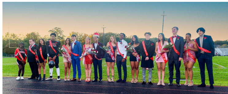
THE MEMBERS OF THE HOMECOMING COURT ARE GIVEN SASHES, FLOWERS AND CROWNS PRIOR TO THE START OF THE HOMECOMING GAME.