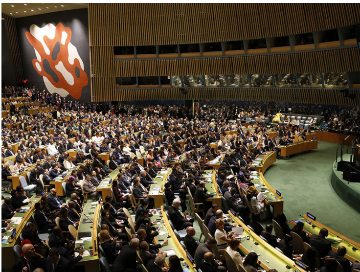
THE 76TH UNITED NATIONS GENERAL ASSEMBLY IS IN SESSION IN NEW YORK CITY.

President Biden ended the speech by saying that these crises, which affect not only the U.S. but all countries around the world, are his main focuses. He wants to work together to ensure that these problems don't grow out of control and that maybe by working together with other countries they can stop them altogether.