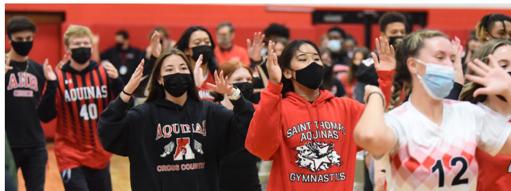
STUDENTS JOIN IN THE CELEBRATION AT THE END OF THE MASS TO GET EVERYONE INVOLVED IN SINGING “BIG HOUSE.”

The athletes who were assembled on the track were cheered on as they were called out one by one. Senior athletes were also recognized for their dedication and achievements made in their sport. The gymnasts showed off their impressive moves, making quite the entrance. The cheerleaders gave a Trojan spirit-filled cheer which got