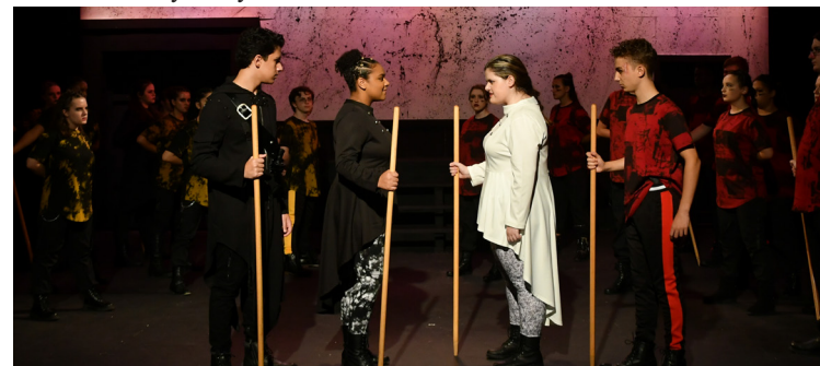
BRUTUS AND CASSIUS MEET WITH ANTONY AND OCTAVIUS ON THE BATTLE FIELD PRIOR TO THE BEGINNING OF THE WAR.

Julius Caesar was a fantastic debut to the drama season. Audiences can't wait to see what's next!